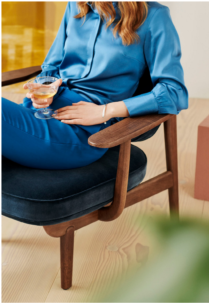
WALNUT STAINED OAK / HARALD 3 (VELVET) 182

Fred<sup>™</sup> works in home, office and hospitality settings.