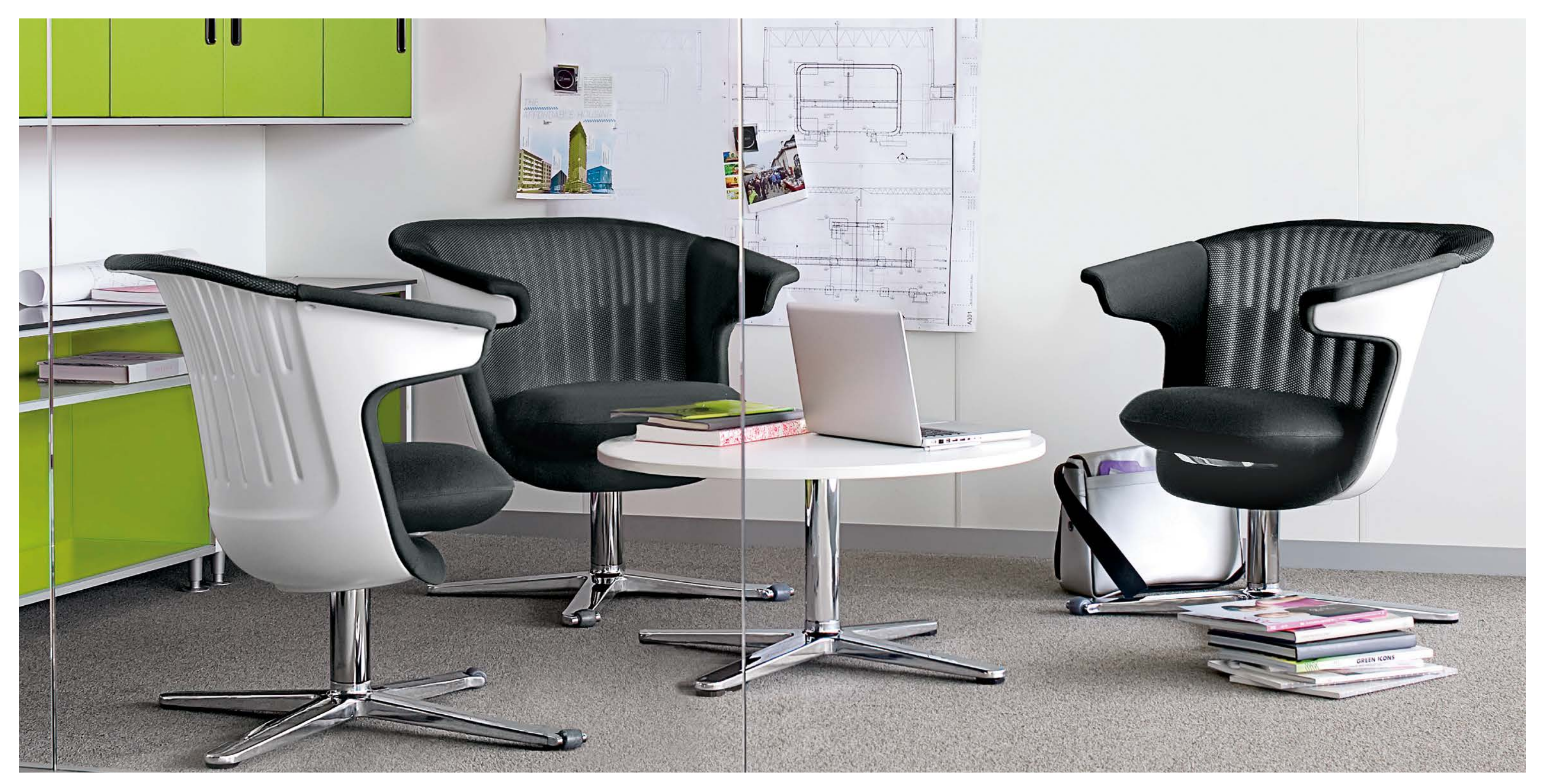
C4831 | I2I CHAIRS (RE03/WHITE), I2I LOUNGE TABLE (WY).