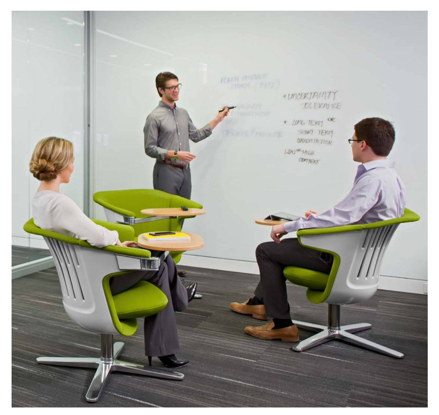
C8817 | i2i CHAIRS (AT03/WHITE/ER)

i2i is also ideal for welcome areas, in-between spaces and small collaborative areas in open or closed office environments.