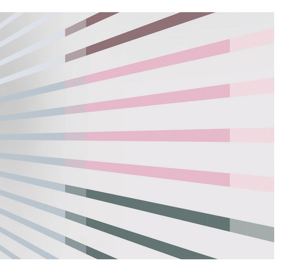
Custom Surface Imagir