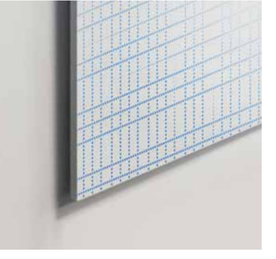
Custom Surface Imaging