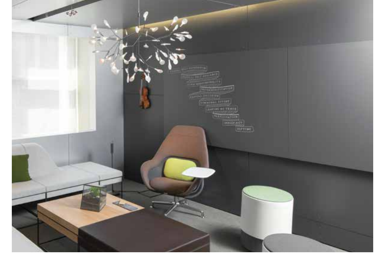
Gray Chalk 6502 C