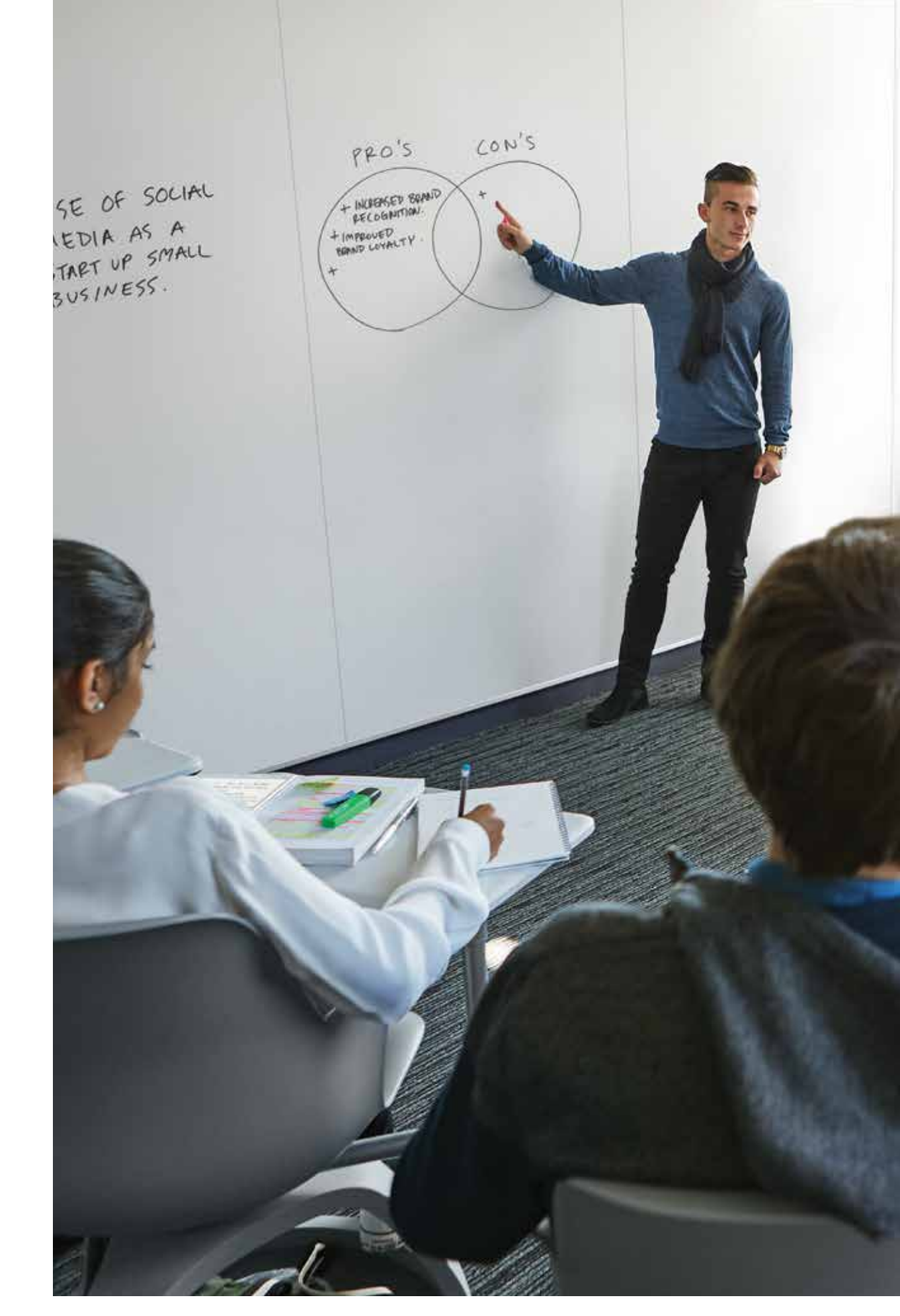
White Gloss 6100 U

The smooth glass-like surface serves as both a highly functional platform for boundless communication and a design feature to aesthetically enhance any environment. With a clear marker-to-whiteboard color contrast, a³ CeramicSteel offers readability not found with other surfaces. It's also magnetic, easy to clean and fully scratch resistant. In fact, it's so durable it has an expected life cycle exceeding 50 years.