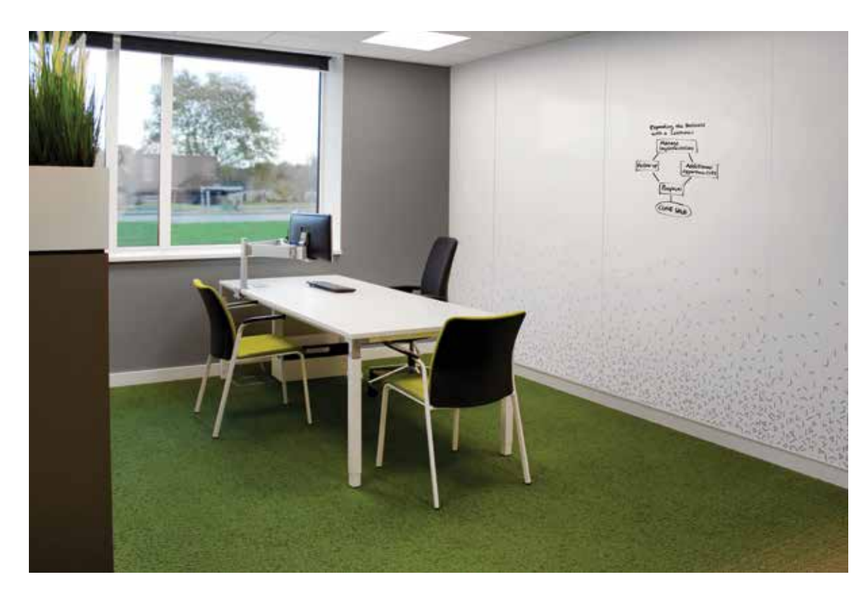
Custom Surface Imaging