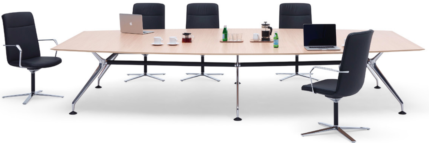
Top – CALDER-MBS4, Bottom – CALDER-HBS