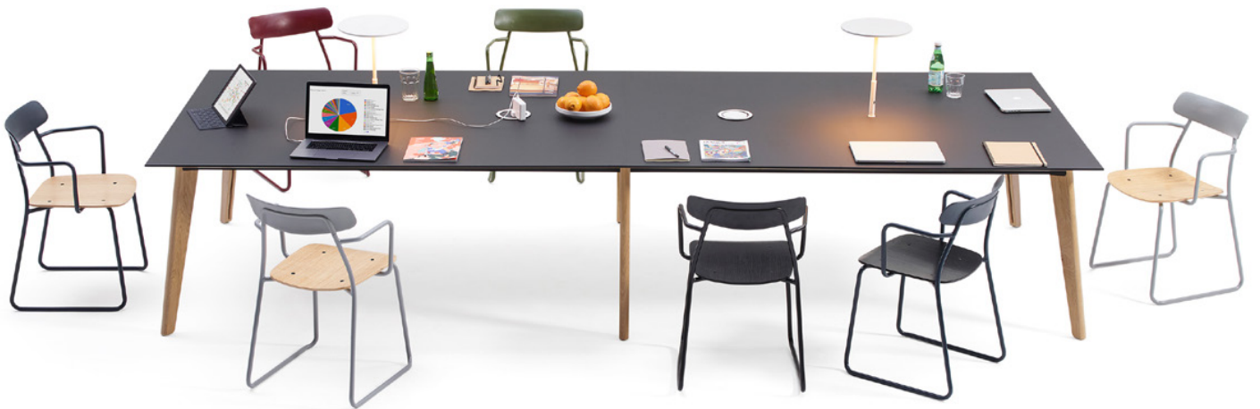
Top – ACORN-S & SA, Bottom – ACORN-SA