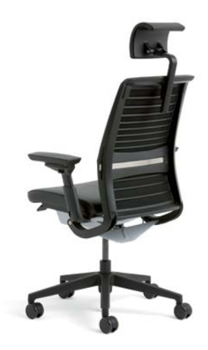
D2810 Optional Headrest