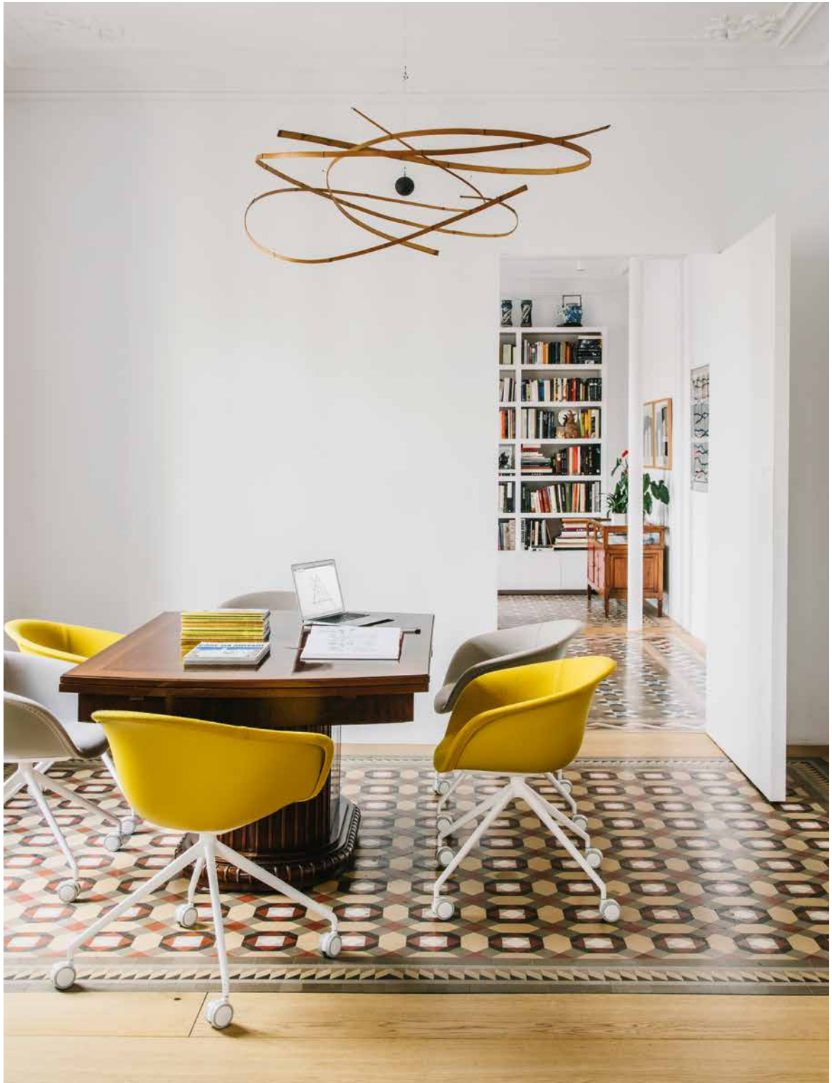
Home office Barcelona, Spain Art. 4217