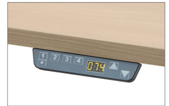
Programmable User Interface