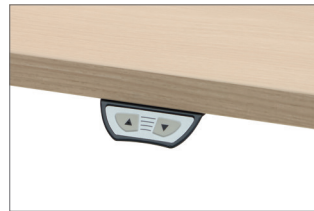
Up/Down User Interface